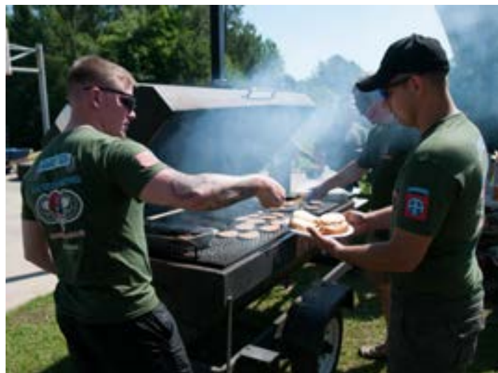
Army leaders build unit cohesion and esprit de corps through a variety of social events like holiday parties and barbecues. Although these well-intended events positively affect unit morale and cohesion, they may inadvertently promote or glamorize alcohol use.

Army organizations conduct many social events to build unit cohesion and esprit de corps. These events help teams develop through socializing. Some events have a professional attendance obligation, including military balls, unit dining in/dining out functions, and