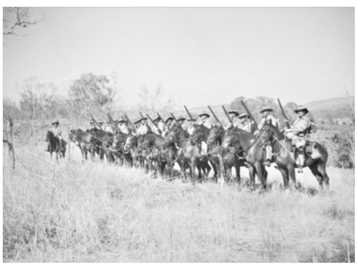
North Australia Observer Unit on parade in Katherine, 1943

Due to its central location Katherine was chosen as the base for the North Australia Observer Unit (NAOU). Comprising 600 men, many of whom were chosen because they had good bush skills, they were grouped into three Field and one Headquarters Company. Headquarters were situated where the Katherine South Primary School now stands. Established as a bush commando unit in 1942, the NAOU had the huge task of coastal surveillance from Derby in Western Australia to Normanton in the Gulf of Carpentaria and inland to Halls Creek, Alice Springs and Cloncurry.