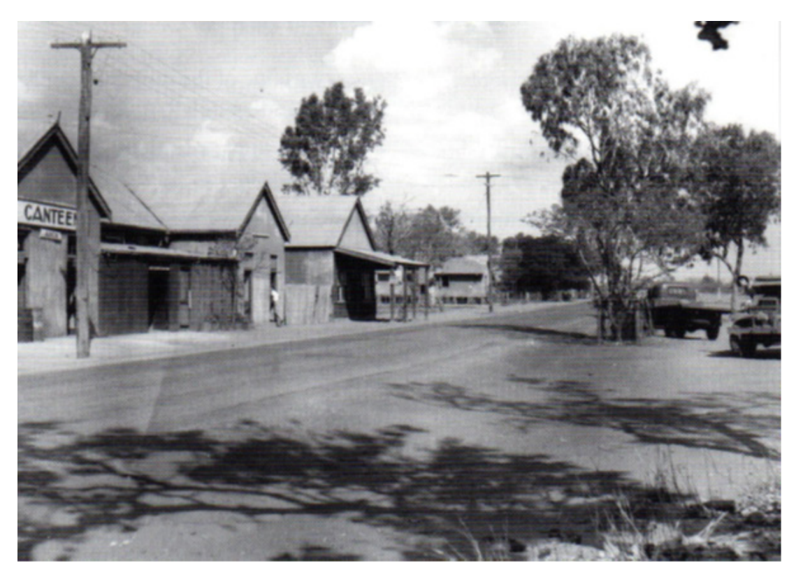
Katherine Main Street 1943, From left Commercial Hotel (now Stuart Hotel), Building with awning Katherine Stores (now 5 Star Supermarket, low elevated building the Civic Hall.

By 1941, Katherine was bulging at the seams under military command as it became a major supply and maintenance centre, and more so in 1942 after the bombing of Darwin. In late 1941, the Australian Army was sending troops to Katherine for training and support units and headquarters were established.