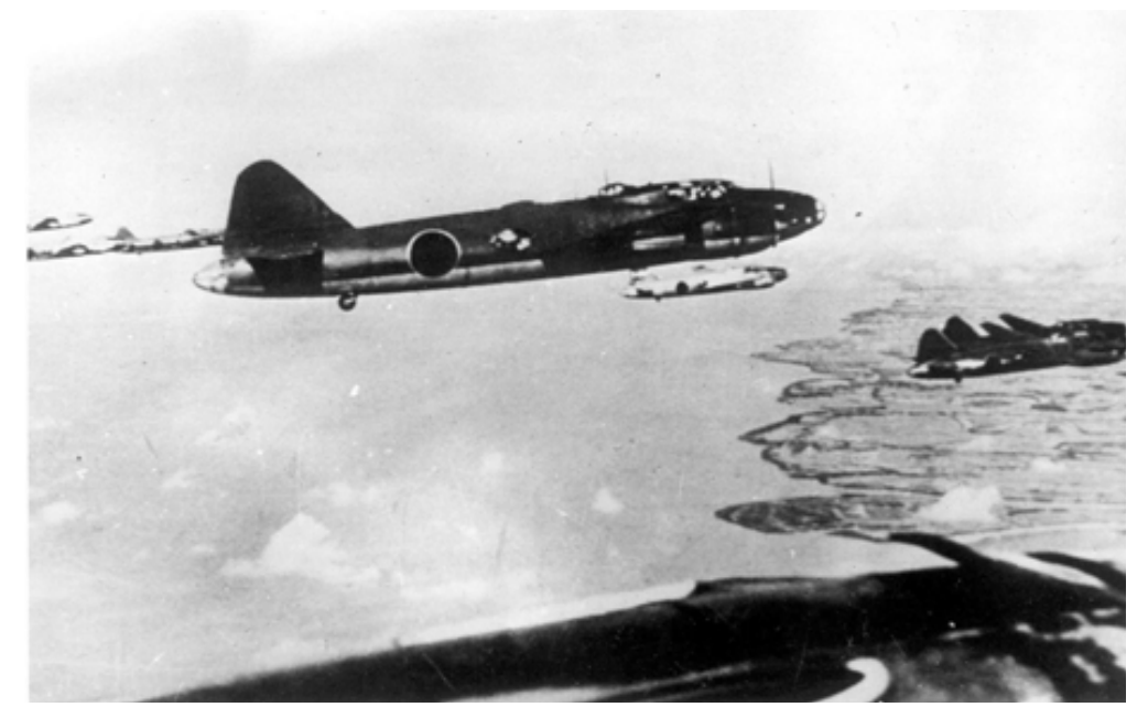
Takao Ku Betty Bombers over the coast.

Today we reflect on a raid on Katherine by aircraft of the Imperial Japanese Navy and pay tribute to the tens of thousands of Australian Army and Air Force personnel, along with those of the United States Army who were stationed in and around Katherine during World War II. Together with thousands of civilians who made an essential contribution to the war effort. The people of Katherine endured extreme hardship during the bombing of Katherine and the war years, with little services available to them, families were torn apart during evacuations and all the while in harsh environments.