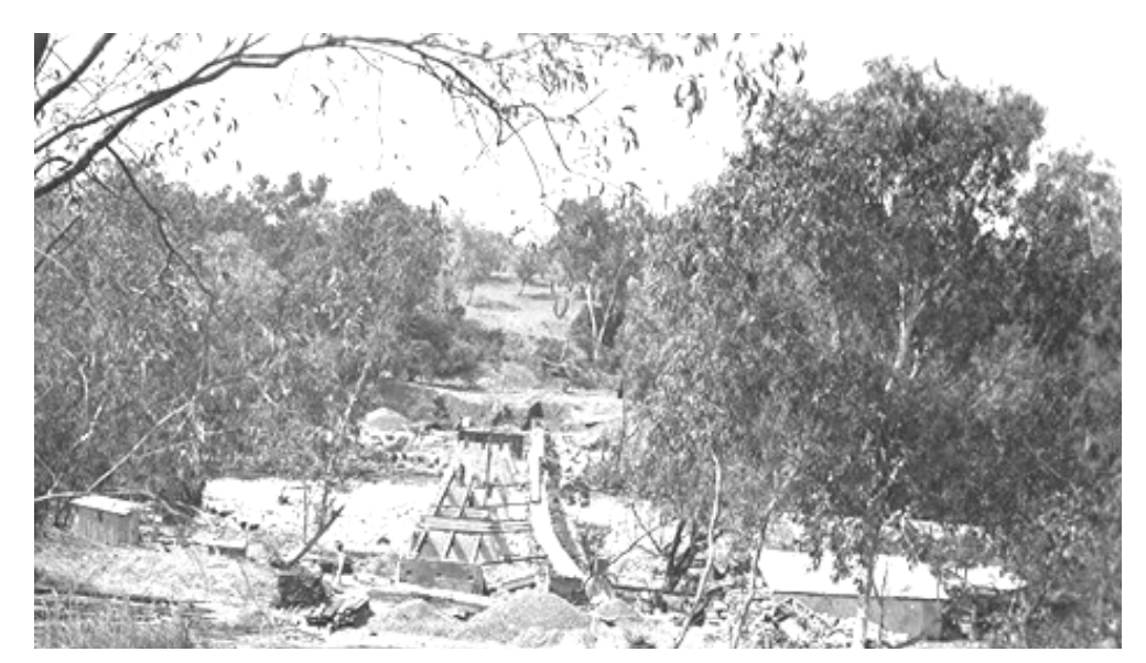
The Allied Works Council (AWC) constructed and sealed major sections of the north-south road, now the Stuart Highway, including the first river bridge over the Katherine River, The Low Level Bridge.

In fact, the various Australian state authorities undertook the job and construction of the stream and river crossings. The first river road bridge over the Katherine River, now known as the Low Level Crossing was constructed. While working for the Allied Works Council the New South Wales Department of Main Roads built the Low Level Bridge, seen here under construction to provide a formal crossing over the Katherine River.