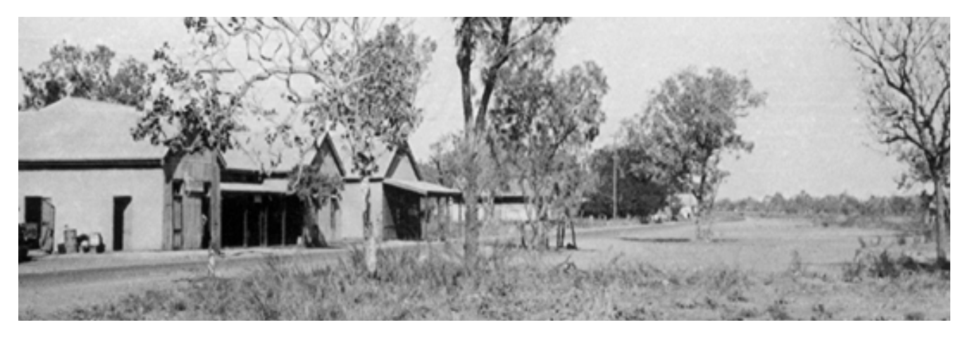
Katherine Main Street prior to the war