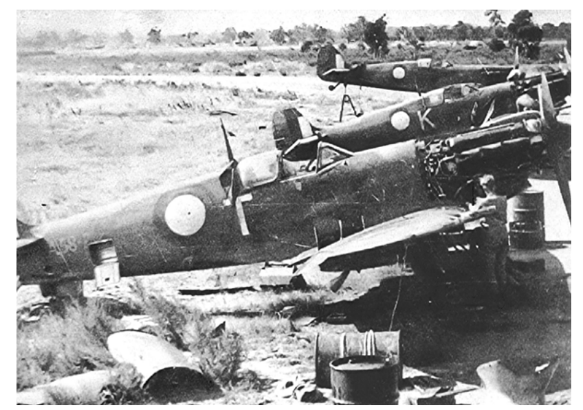
RAAF Supermarine Spitfires being serviced at the Katherine Airstrip, 1943

A small pre-war community of just 250 people, Katherine was transformed into a major military centre supporting units of the Royal Australian Air Force (RAAF), Australian Army, United States Army and United States Army Air Force (USAAF). On 22nd March, 1942 personnel of the first US Army Engineering Unit to arrive in Australia, the 808th Engineer Aviation Battalion, were working to upgrade the Katherine Airstrip at the time nine Japanese 'Betty' bombers commenced dropping their bombs.