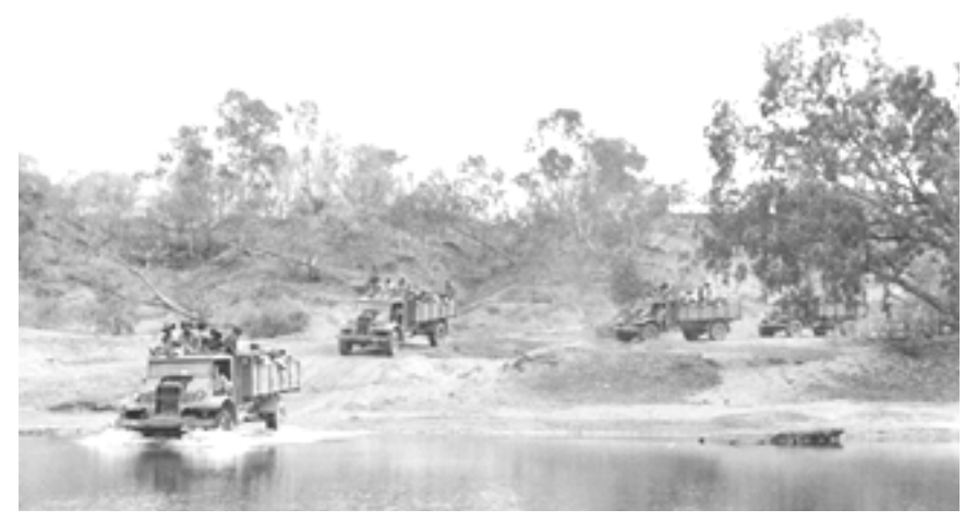
Trucks transporting farm workers crossing the Katherine River at Knotts Crossing on the North-South Road prior to construction of the Low Level Bridge.