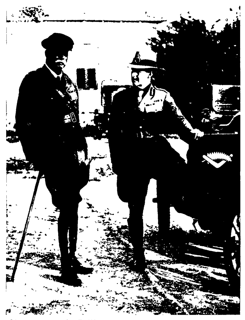
MAJOR-GENERAL SIR E W C CHANTOR (RIGHT), COMMANDER OF THE ANZAC MOUNTED DIVISION, 1917-19, WITH BRIGADER-GENERAL C. F COX (LEFT), COMMANDER OF THE 1ST AUSTRALIAN LIGHT HORSE BRIGADE, 1915-19